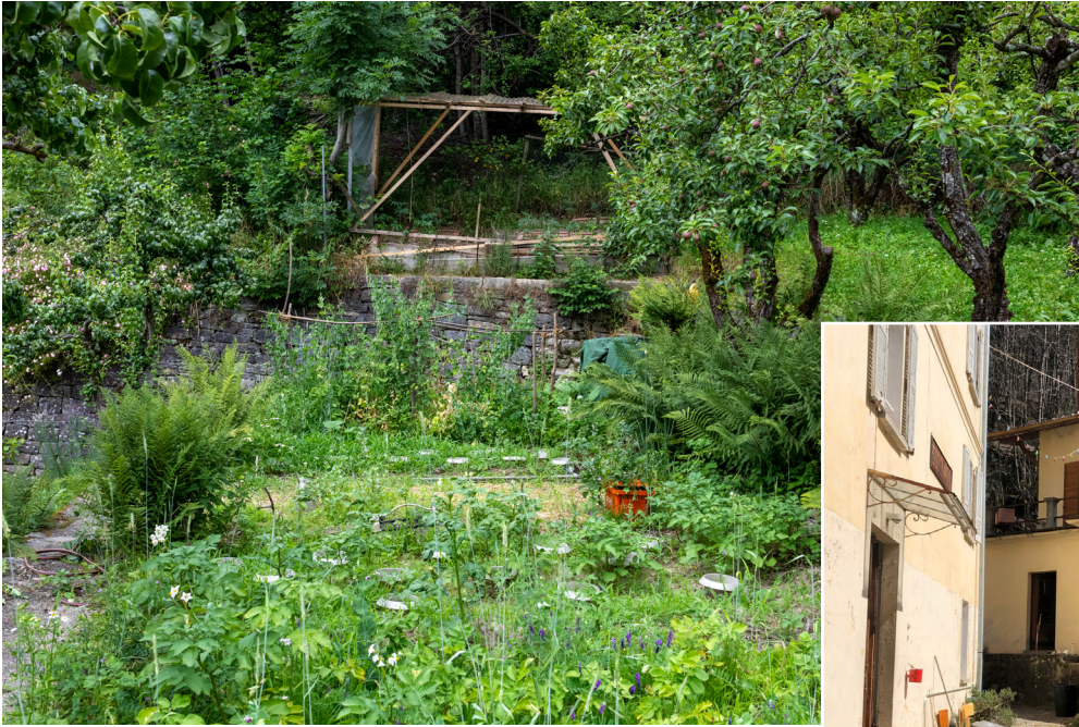
Vegetable garden with fireplace