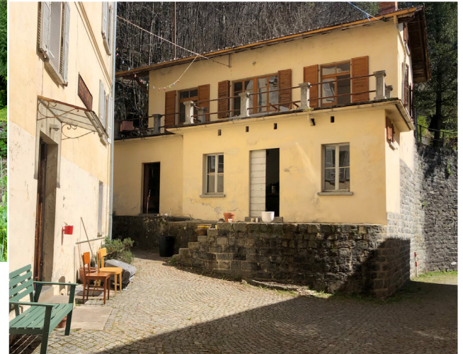
Courtyard Cima Città