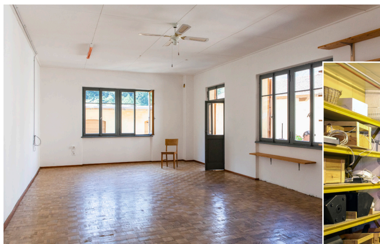
Work and dance room "Giorgio"