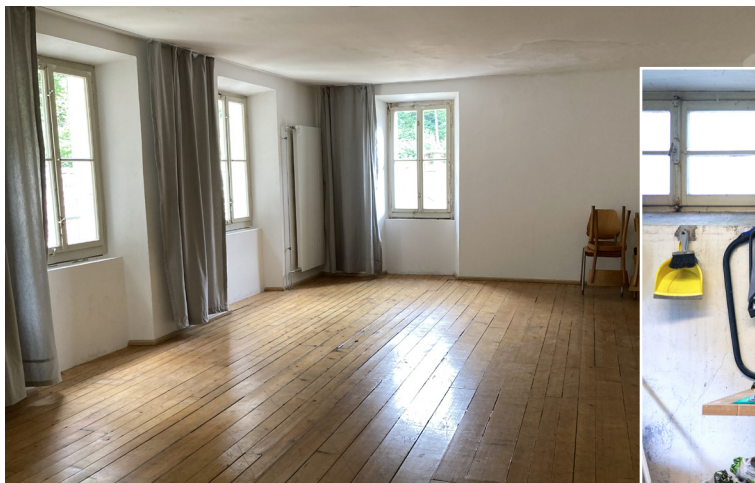
One of many workspaces