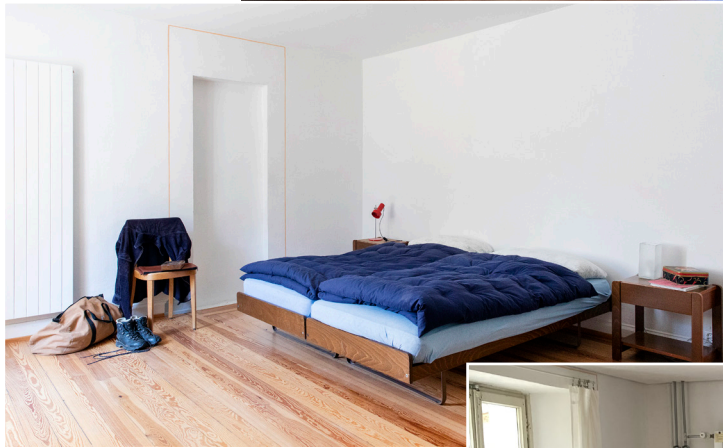
Three of a total of seven bedrooms