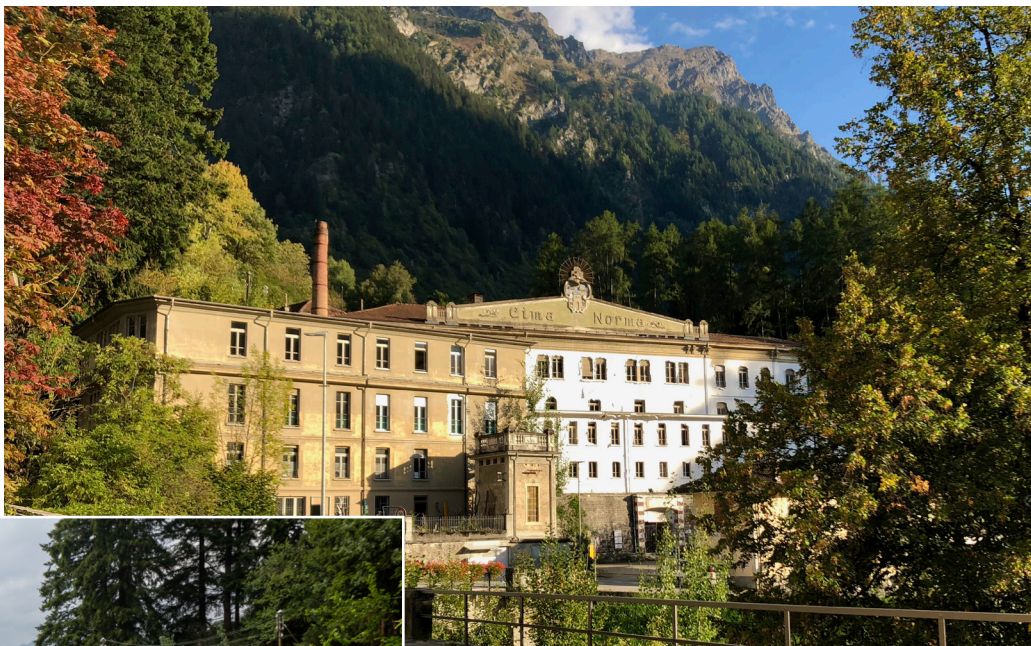
View of the factory from Dangio