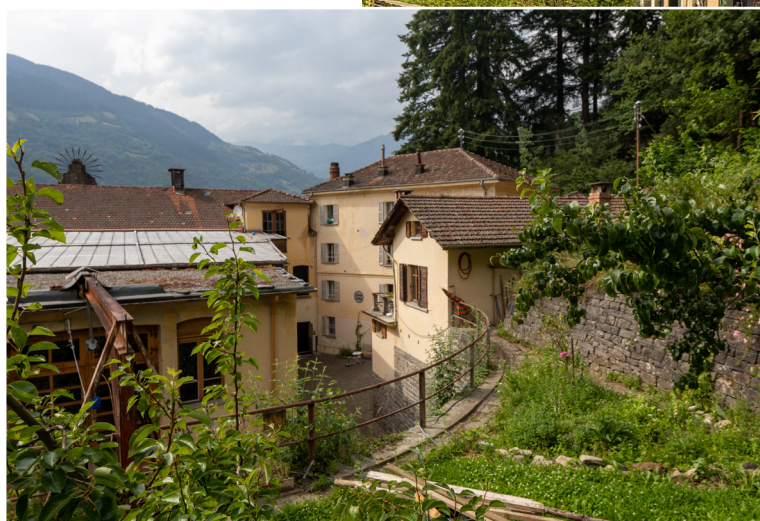
Cima Città is surrounded by mountains, forests and rivers