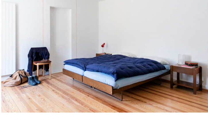
One of seven bedrooms