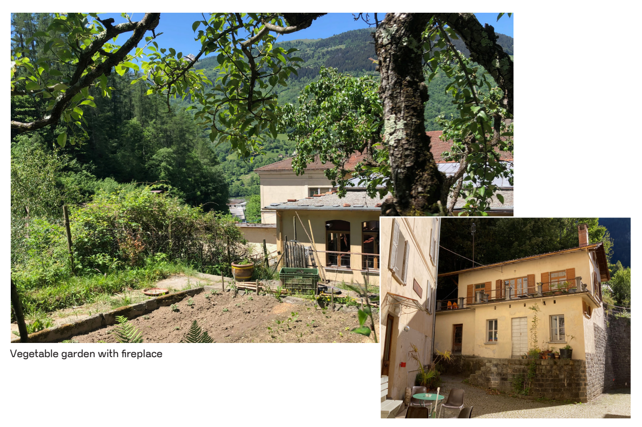
Courtyard and studio house "Giorgio"