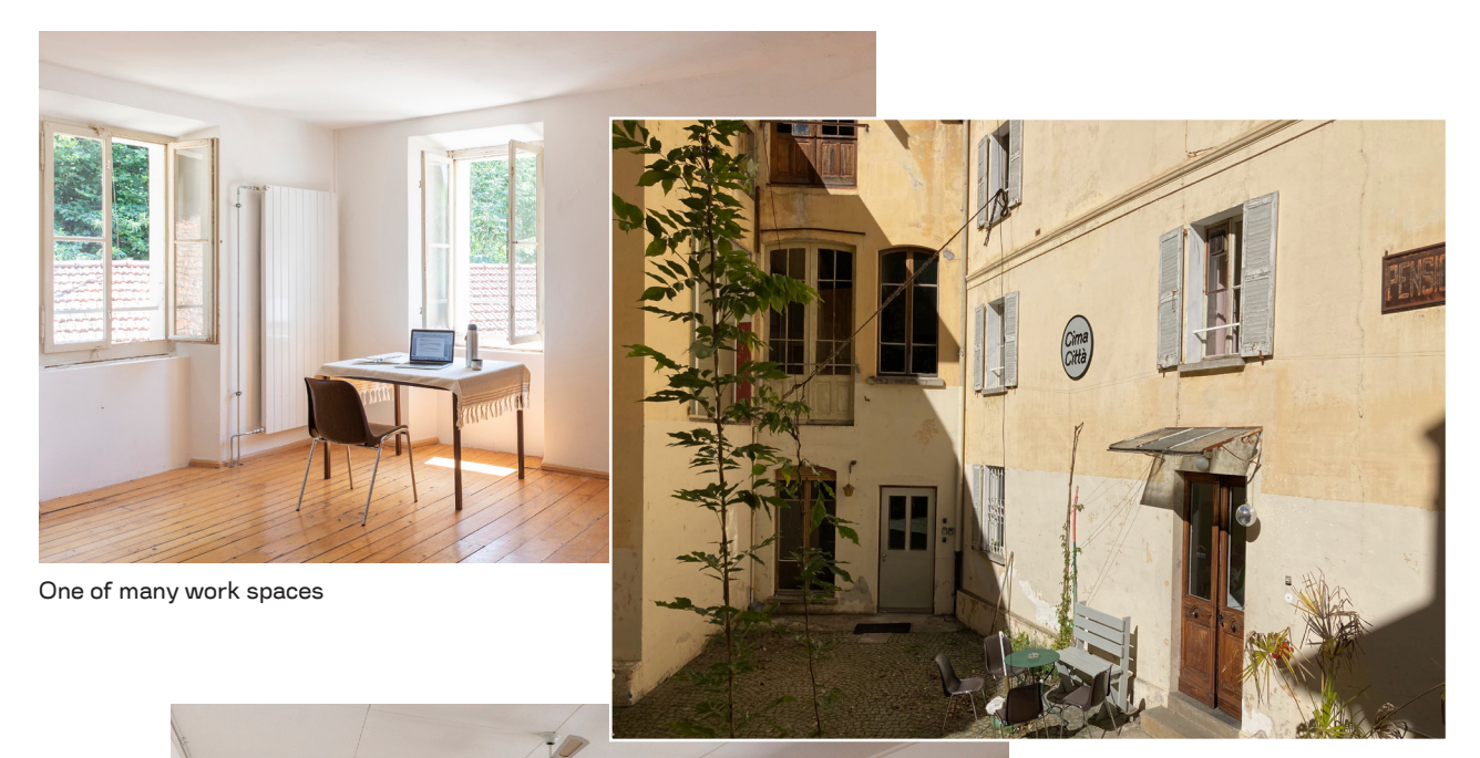
Residency house "Pensionato"